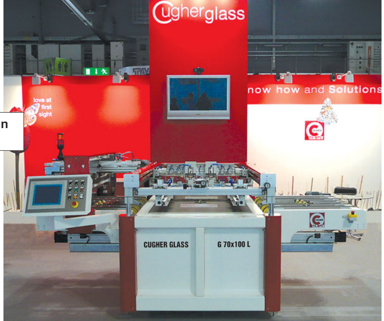
Cugher Glass G Line, on show at Vitrum 2007

pared and ready. At the end of the 90s, the owners of Cugher Glass decided to sell the company, which was bought by a technical partner, a manufacturer of furnaces with considerable experience and plenty of enthusiasm. Cugher Glass became property of the Mazza family, who took the opportunity to unite the competences of the two companies to manufacturing avant garde solutions.