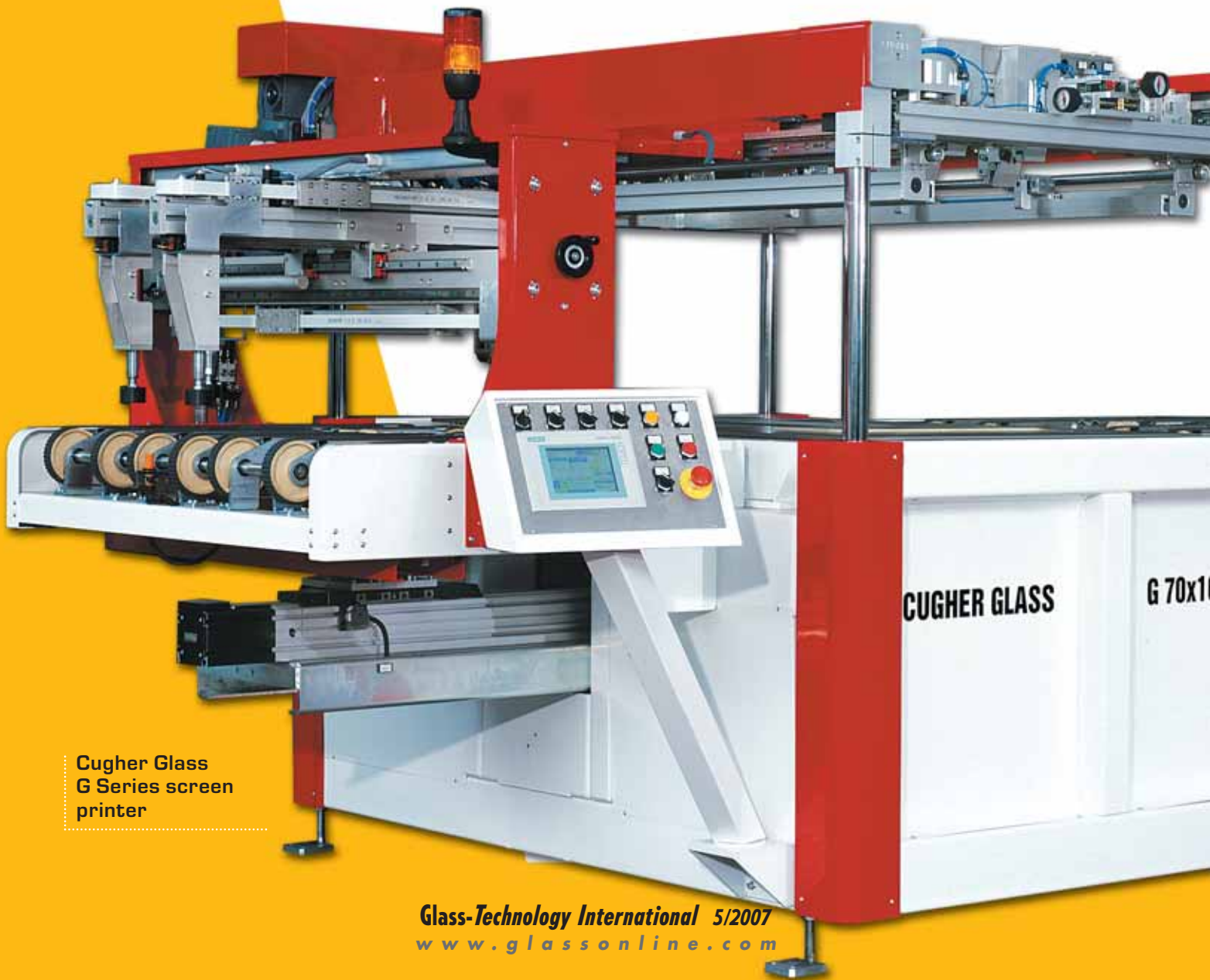
Cugher Glass G Series screen printer